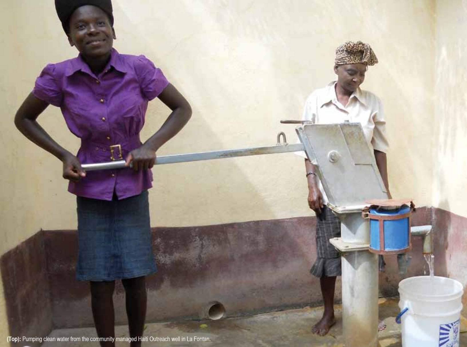
(Top): Pumping clean water from the community managed Haiti Outreach well in La Fontan.