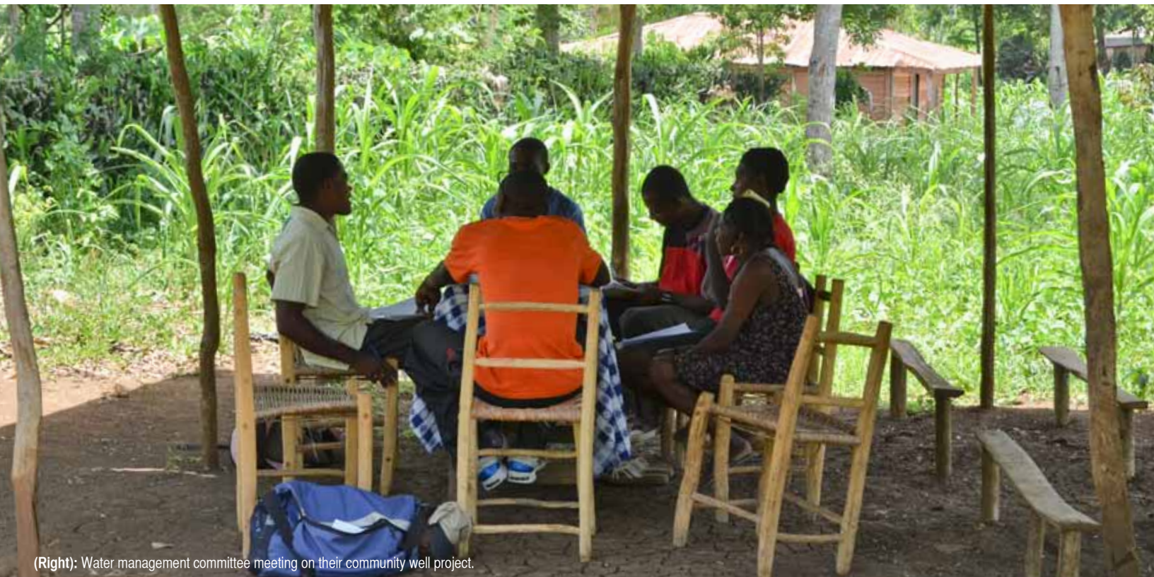
(Right): Water management committee meeting on their community well project.

http://www.haitioutreach.org/support2/volunteer-opportunities/