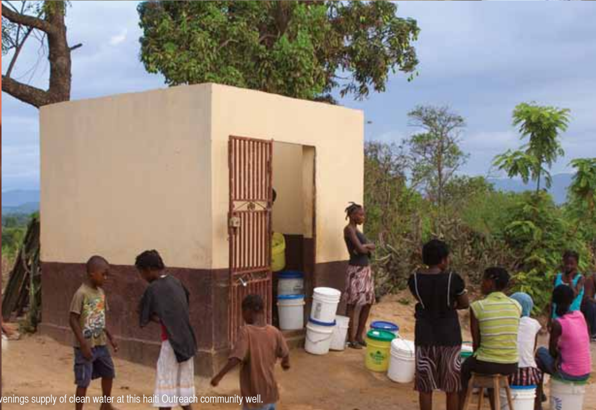
(Bottom): Buckets and people are lined up to get the evenings supply of clean water at this Haiti Outreach community well.