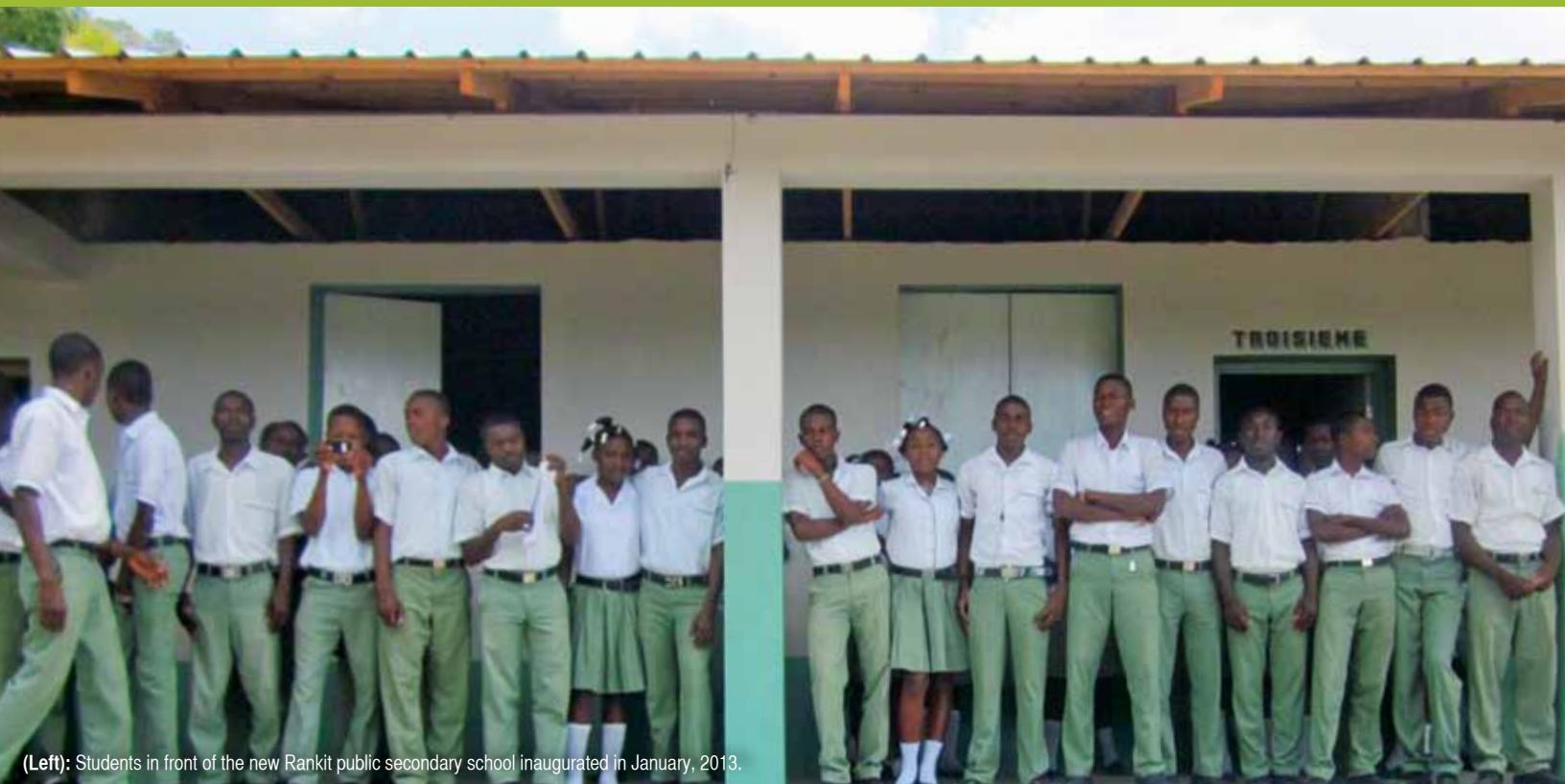
(Left): Students in front of the new Rankit public secondary school inaugurated in January, 2013.