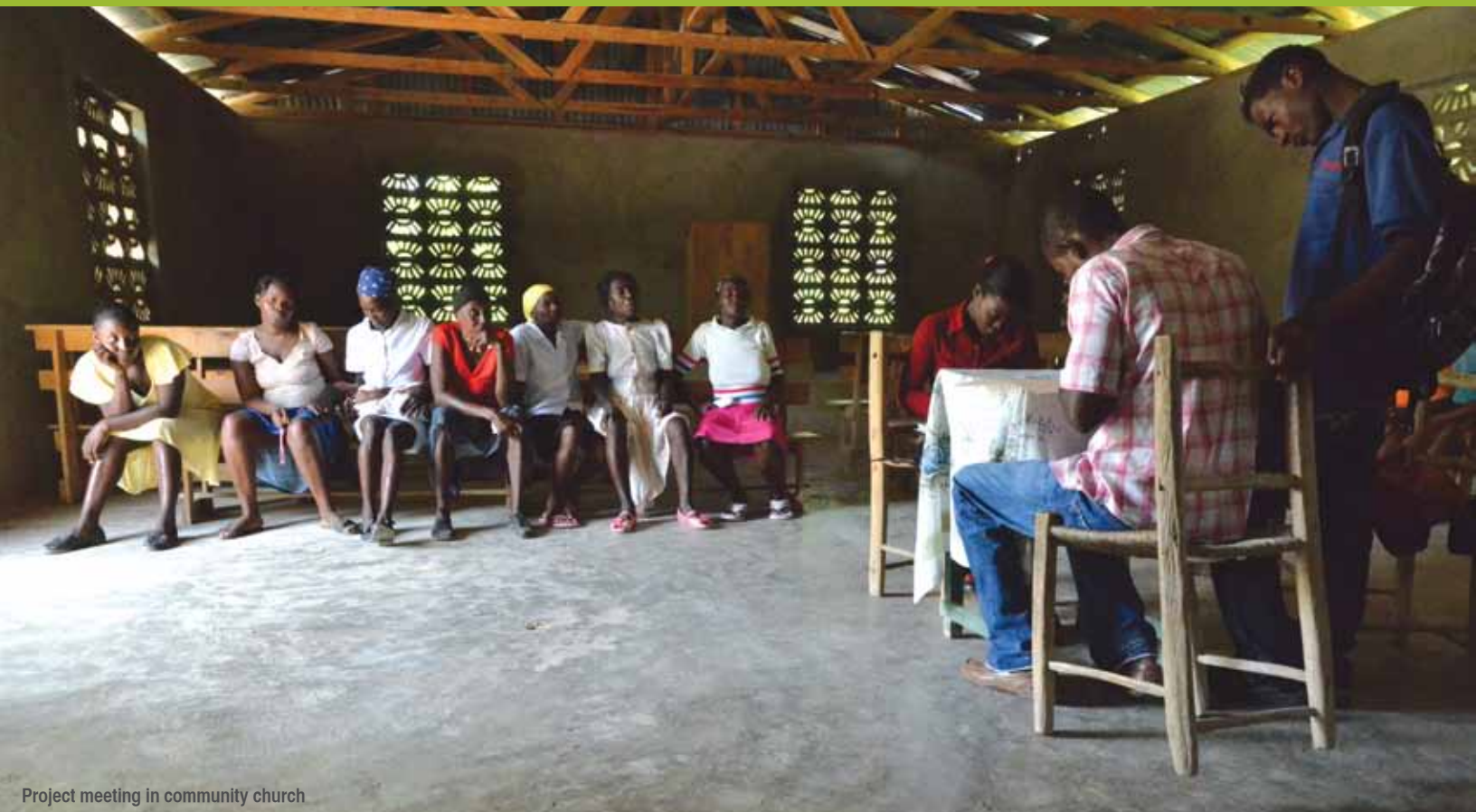
Project meeting in community church

While some committees had trouble deciding which rules to enact, others were adamant. The committees made decisions about rules such as: Do we want to pay a guard to watch the well? How much will we charge community members to use the well? Who will manage the banking? Throughout the interactions, I watched as the Haiti Outreach Animators moderated and carefully coached the committee to think about the potential problems and solutions that they may face. The Animators had the ability to empower the committee to establish a plan and strategy to approach impending issues. I was pleasantly surprised to observe that the Animators never forced the committee to choose a specific rule; instead the Animators facilitated the development of new thinking and skill building, which enabled the committee members to make the best decision for their community.”